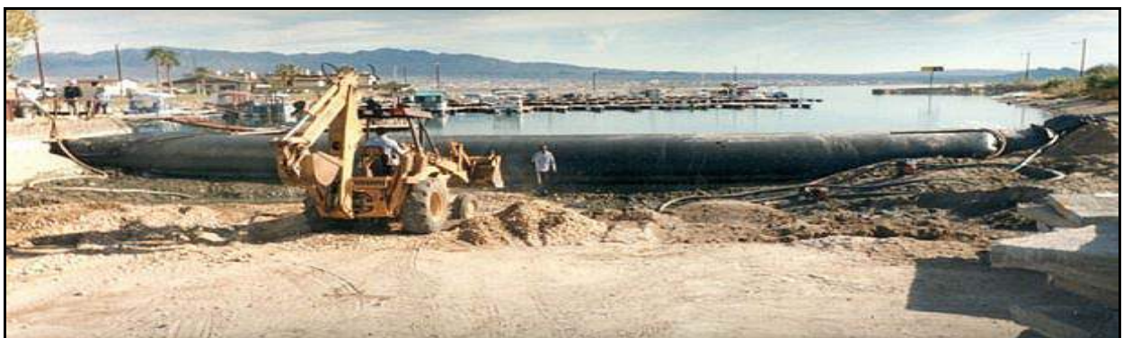
6' high AquaDam® in Lake Havasu, CA, along the Colorado River.