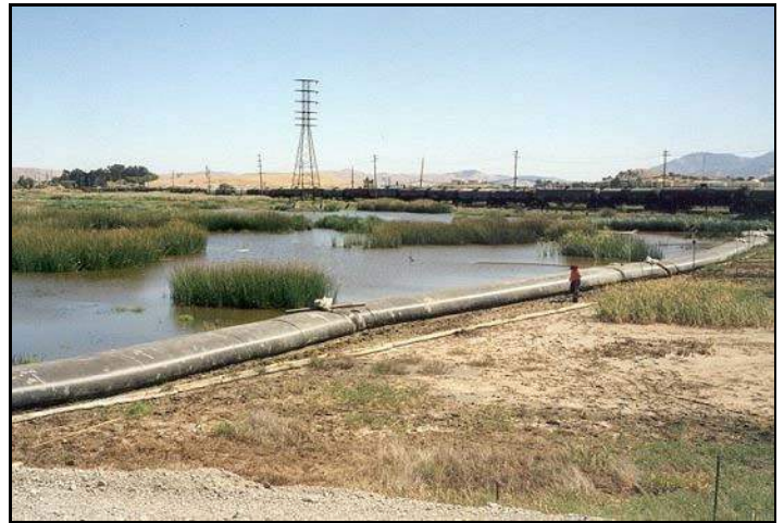
AquaDams® at an oil refinery in Martinez, CA.