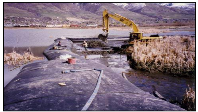
Wetland construction, Great Salt Lake, UT