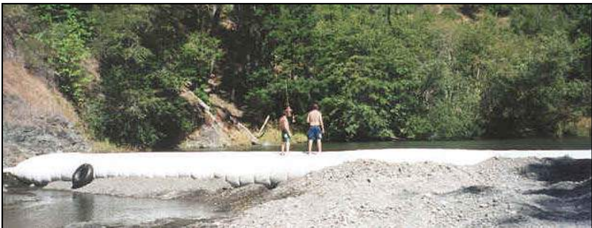
A 5' high AquaDam® installed in Larabie Creek, CA to contain water for a swimming hole.