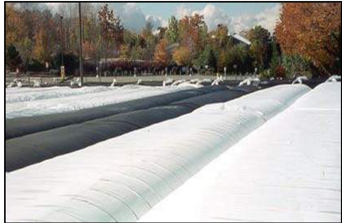
Another picture from Sea World Ohio.