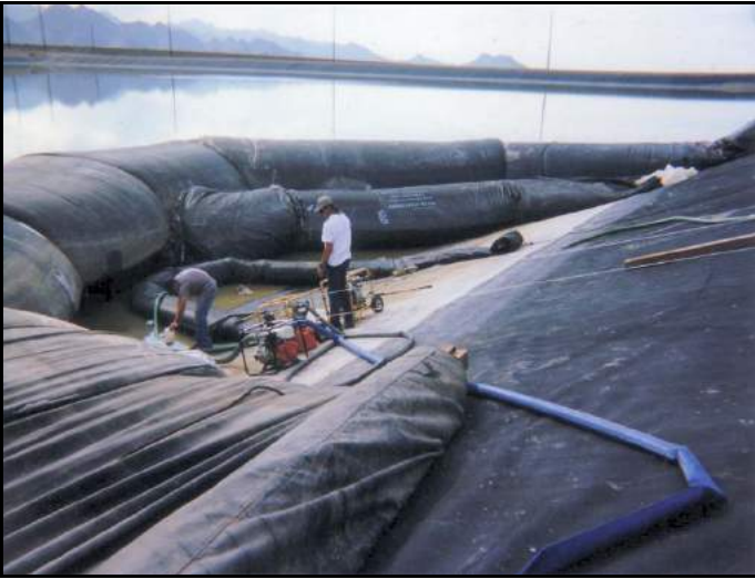
6', 4' & 1.5' high AquaDams® near Kingman, AZ.