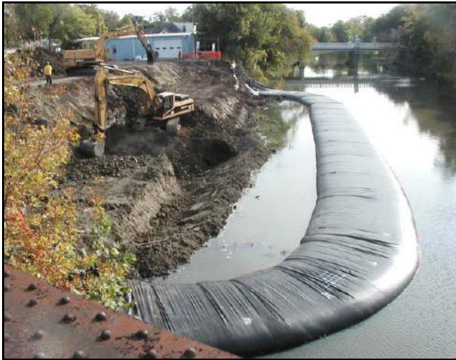
AquaDam® being used to isolate the Vermilion River from contaminants, Pontiac, IL.