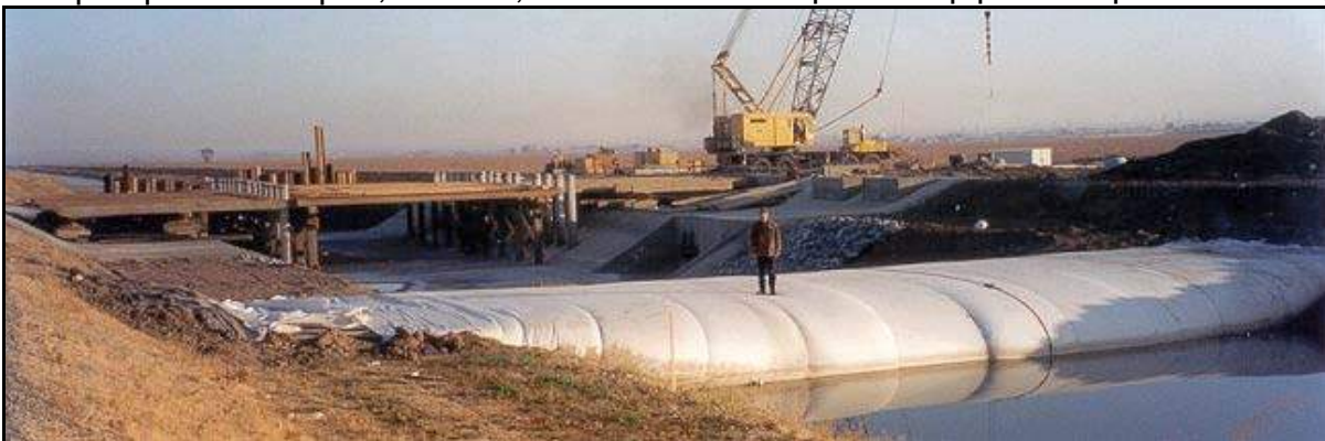
10' high AquaDam® used to dewater for bridge pier construction, Sacramento, California.