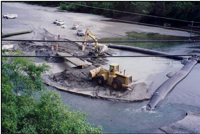
Mad River, Arcata, CA.