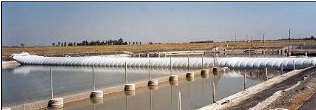
7' high AquaDam® used to split a sanitation pond in Yolo County, CA.