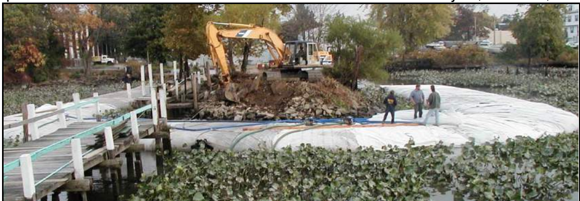
8' high AquaDam® used to isolate a work area for pier construction in Philadelphia, PA.