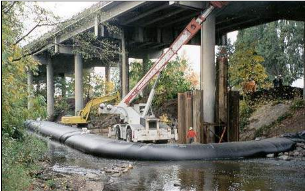
Several 6' high AquaDams® used to dewater a bridge pier for retrofitting in Bear Creek, Medford, OR.