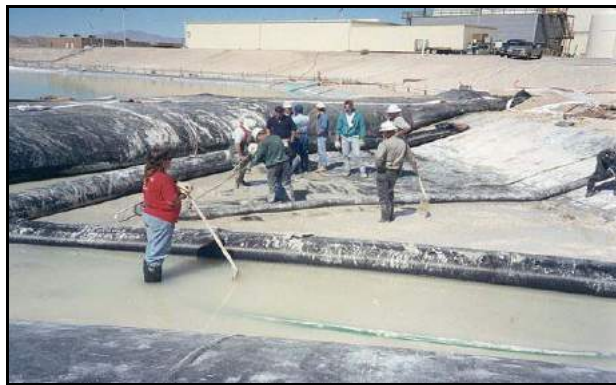
Nevada Cogeneration Associates Power Plant #1