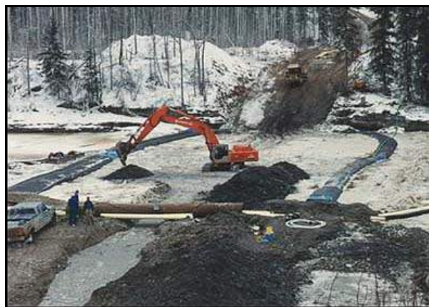
Natural gas pipeline crossings in Alberta, Canada and Ft. St. John, B.C.