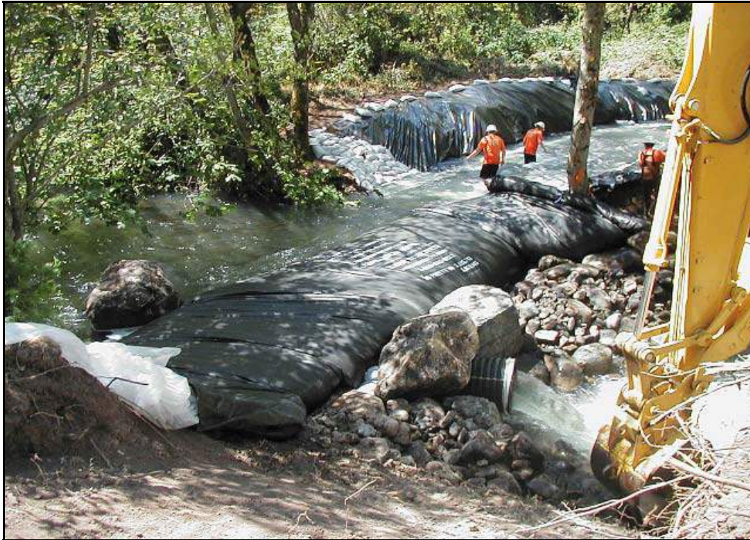
5' high AquaDam® used to divert water for installation of an irrigation check dam in Apple Creek, OR.