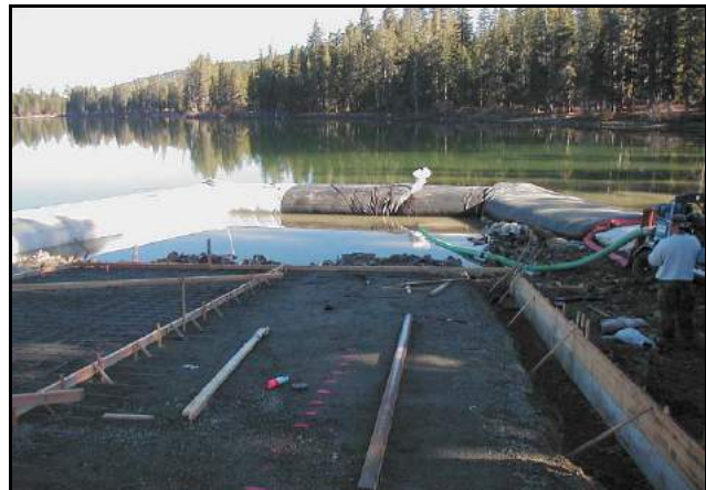
AquaDams® used to dewater for boat ramp construction on Gold Lake, CA.