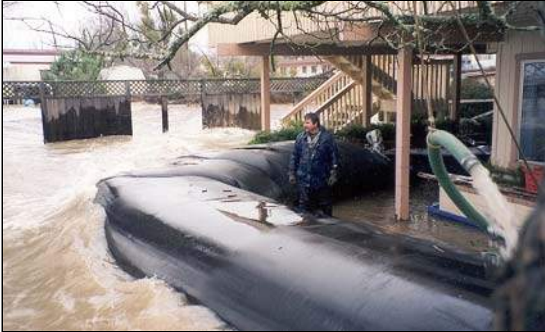
3' high AquaDams® being used for homeowner flood protection in Clear Lake, CA.