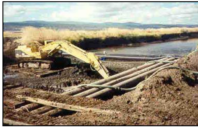
6' high AquaDams in the Pitt River, CA. The river passed through the pipes.