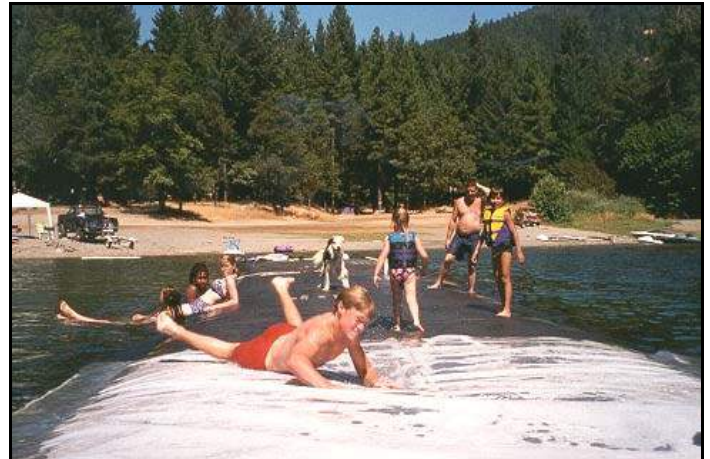
The end of this AquaDam® was covered with slick plastic to create a giant slip-and-slide.