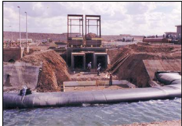
AquaDams® used to dewater a canal bank on the Salt River Project, Phoenix, AZ.