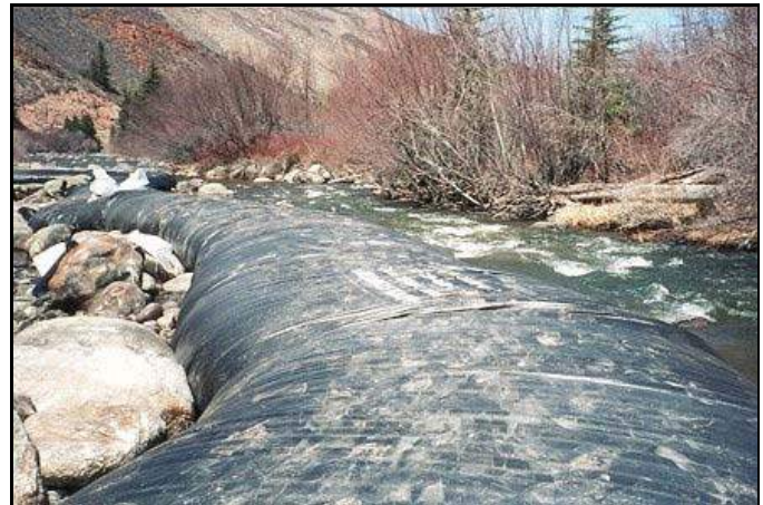
Eagle River, Vail, CO