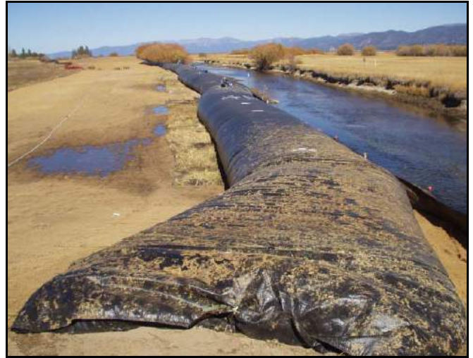
4' high AquaDams® used to separate the Upper Truckee River from newly created wetlands to prevent erosion into Lake Tahoe, Lake Tahoe Keys, CA.