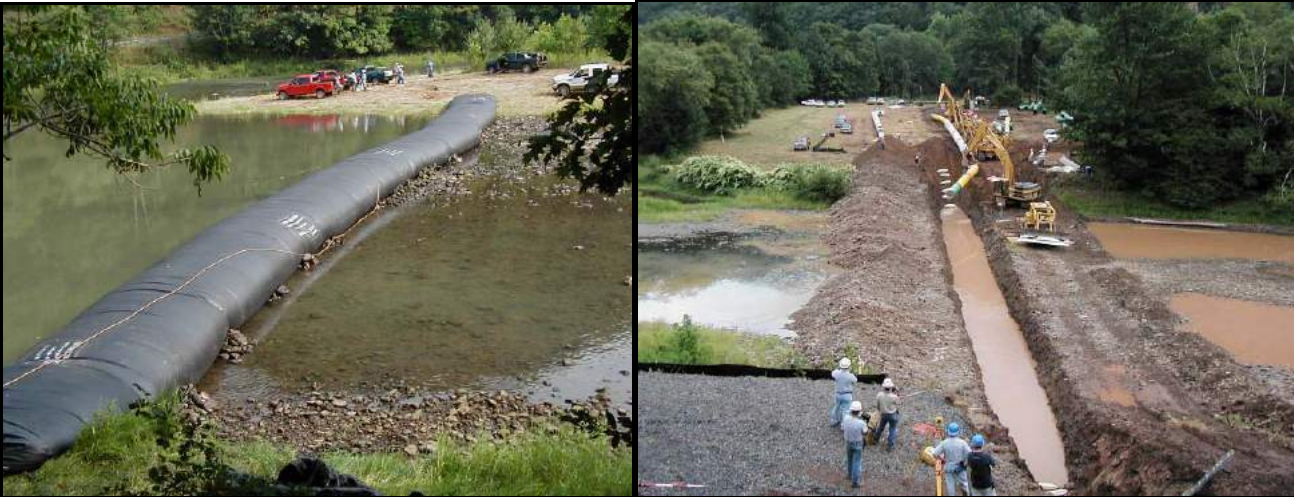
4' high AquaDams® were used upstream and downstream of this trench to contain sediments during a Williams Transco gas pipeline installation in Pine Creek, Williamsport, PA.