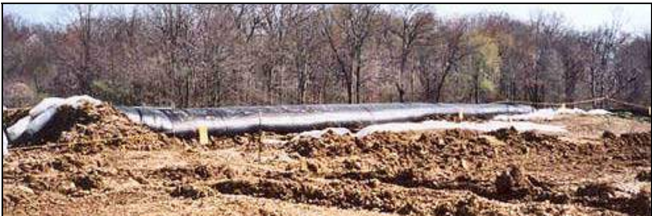
6' high AquaDam® used to store low-level radioactive water for Westinghouse in Northern PA.