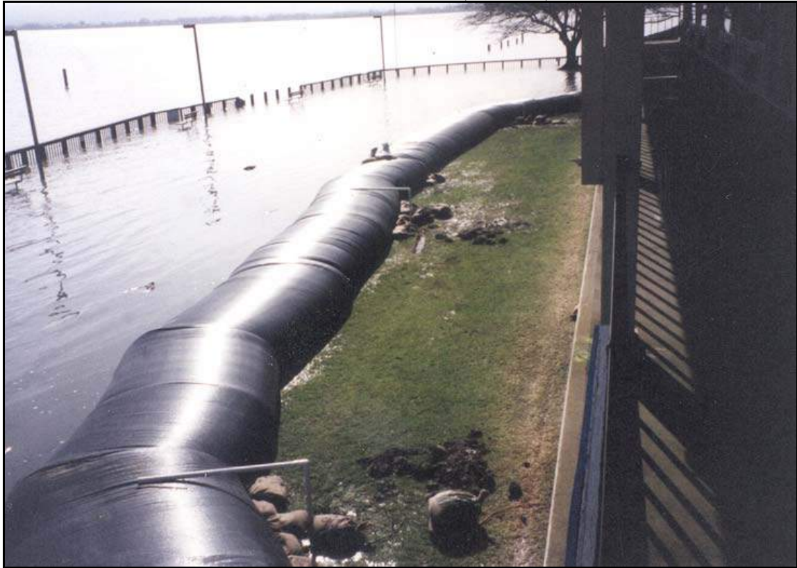
4' high AquaDams® used for flood protection of the Skylark Hotel in Clear Lake, CA.