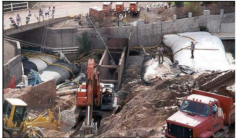
8' and 4' high AquaDams® used to dewater for "open cut" pipeline repair in Parker, AZ.