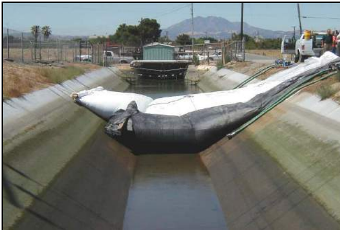
8' and 5' high AquaDams®, used to dewater a canal for pump station repair, Antioch, CA.