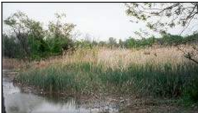
Years later, vegetation at Kingman Lake