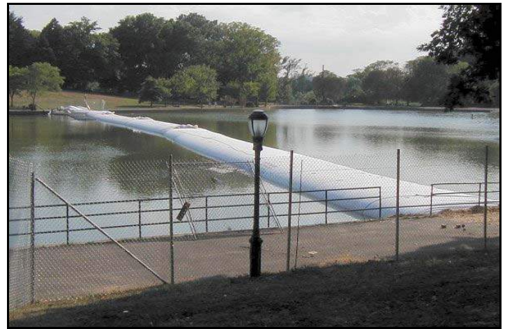
Kissena Lake, Queens, NY