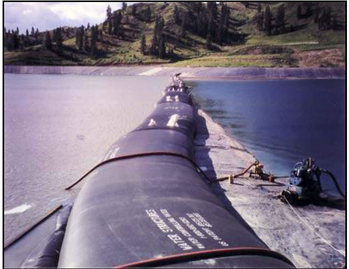
1,300 linear feet of AquaDams® in an arsenic pond, Northern WA.