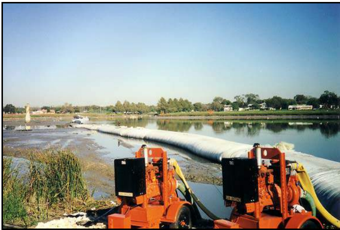
Woodlawn Lake, San Antonio, TX