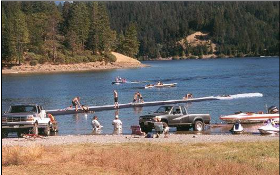
A 6' high AquaDam® installed for recreational use in Ruth Lake, CA.