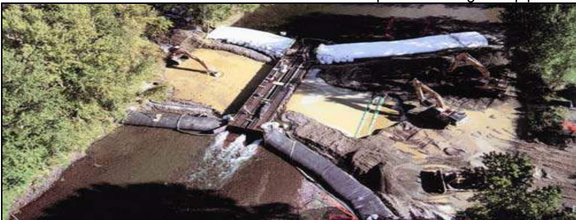
8' and 6' high AquaDams® abut into the sides of a flume near Grand Forks, BC.