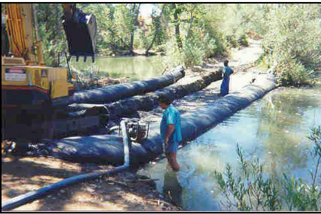
1.5' high AquaDams® in Oakland, CA.