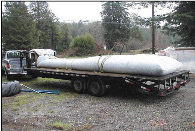
This AquaDam® has been used to convert a flatbed trailer into an instant water tank.