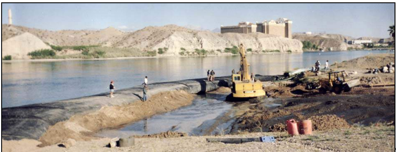
high AquaDam® used for boat ramp construction in Bullhead City, CA.