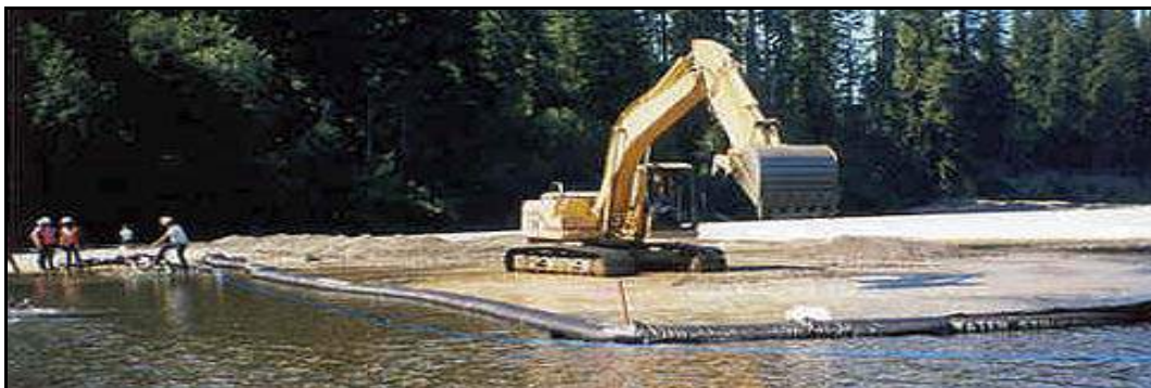
Fish habitat construction on the Eel River, Redcrest, CA.