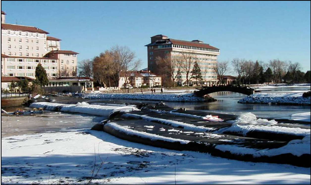
A combination of 8' and 14' high AquaDams® used to isolate and dewater one section of a lake separating two building complexes at the Broadmoor Hotel, Colorado Springs, CO