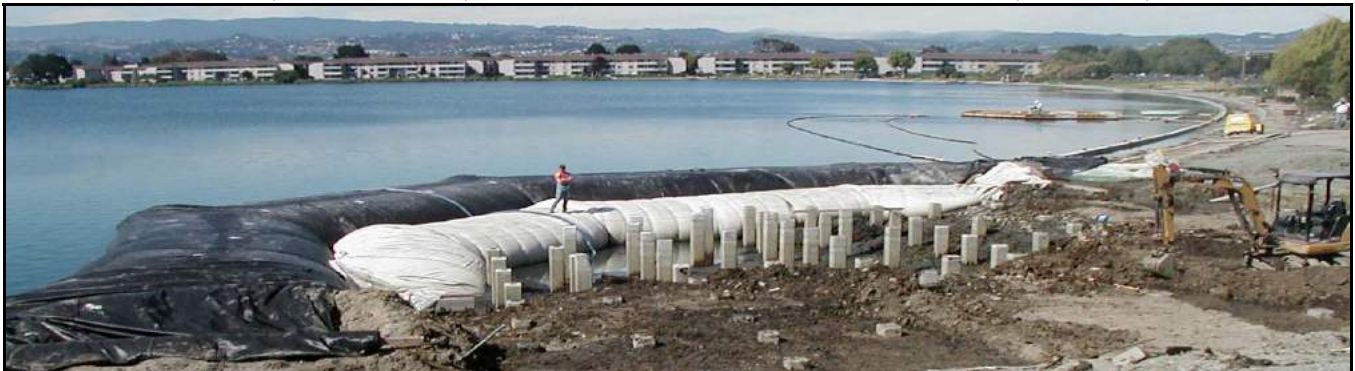
Dewatering for amphitheatre construction, Foster City, CA.