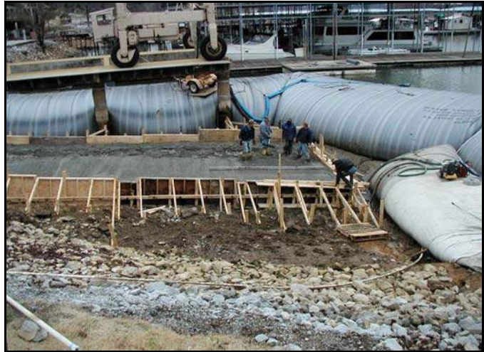
12' high AquaDam® in Chattanooga, TN, along the Tennessee River.