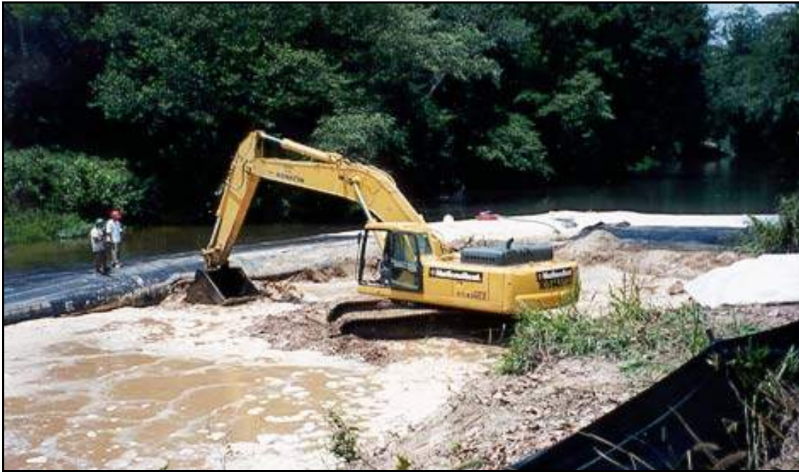
8', 6' and 4' high AquaDams® used to contain sediments during a Williams Transco natural gas pipeline repair project on the Bogue Chitto River, McComb, Mississippi.