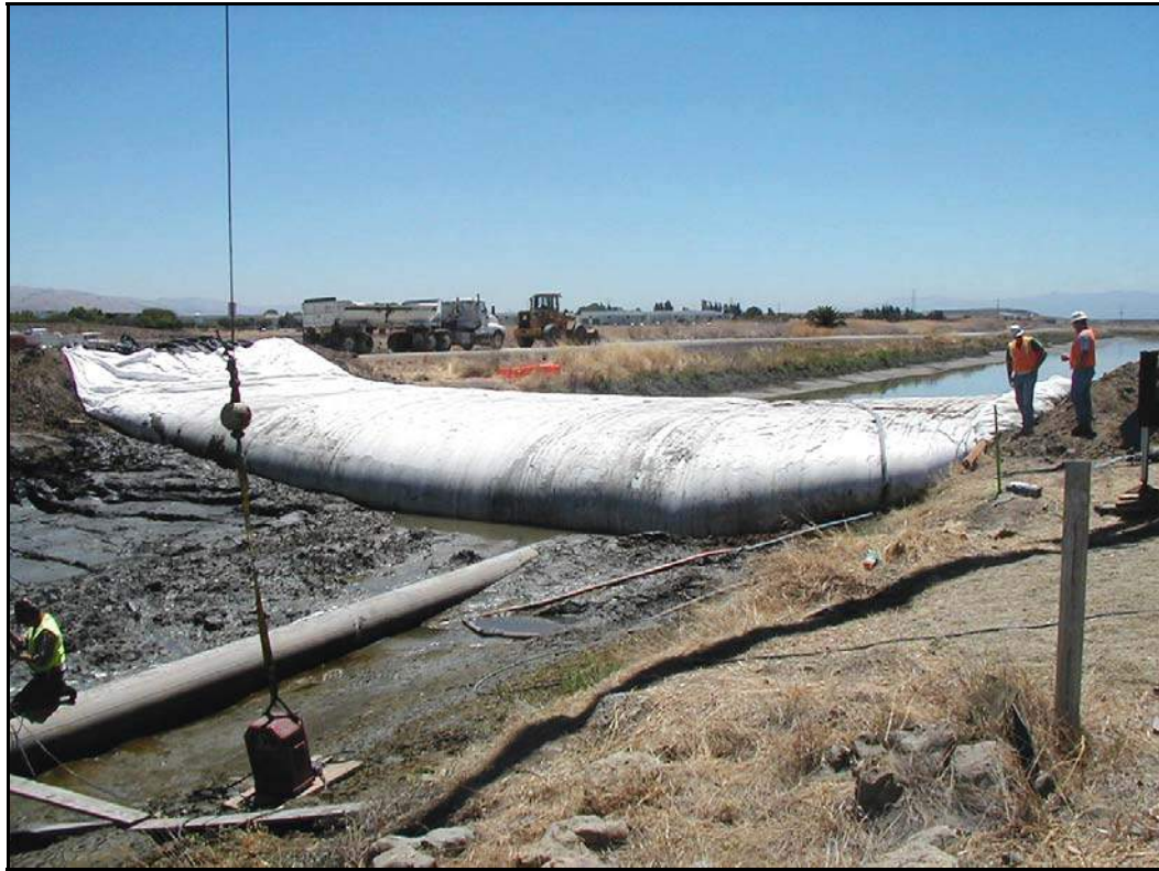
14' high AquaDam® used to dewater a tidal canal in Fremont, CA.