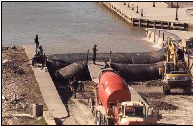
AquaDams®, used to dewater for boat ramp repair on Lake Erie, OH.